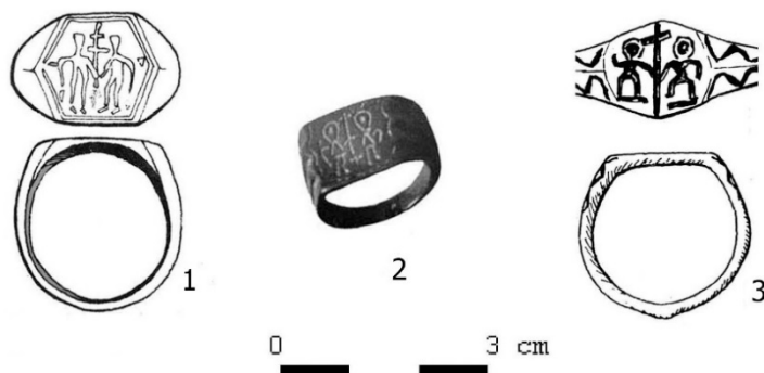
Fig. 2 – Rings with two human figures with a cross between them (Trnjane: 1; Debrč: 2; unknown finding location: 3)

There are three findings from the group of rings with the composition of a cross between figures on the head of the ring: from the necropolis of Trnjane, the village of Debrč near Šabac and from the Danube valley area, unknown site location (Fig. 2: 1–3). 22 Human figures represented in this way on medieval rings are connected through Roman and Byzantine rings to Christian themes. 23 Motives of saints are the most common on golden rings from the second half of the 4th up to the end of the 7th century. Those were usually two busts with a Latin cross between them; certain examples also have an inscription. 24 Representations of male and female standing figures holding a cross, interpreted as Emperor Constantine and Empress Helena, also belong to that same period. Representations of these two saints can also be found on amulets worn as a protection against ailments, especially the plague ( constantinatae ). 25 Findings of rings with this ornament from the 12th and the first decades of the 13th century, with two figures and a cross between them, can be interpreted as religious representations of Emperor Constantine and Empress Helena as well, but also as an imitation of those models, transferred to the representations of laic couples. 26