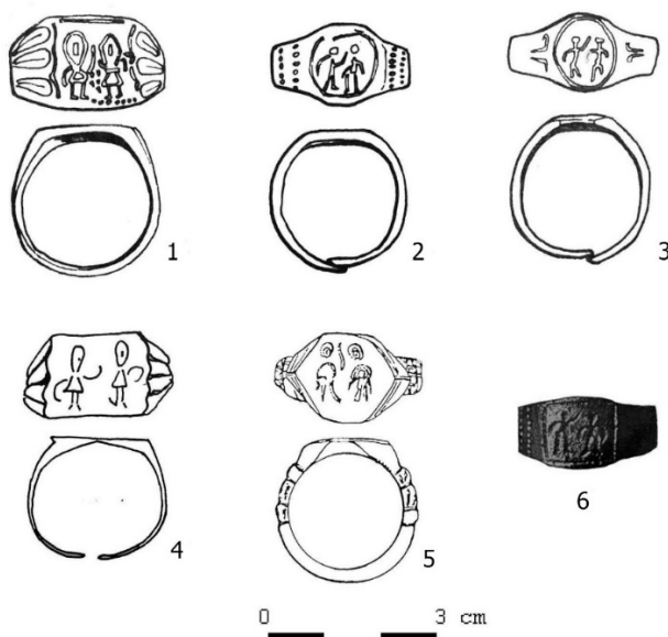
Fig. 3 – Rings with two human figures shown in the act of benediction (Trnjane: 1–3; Kurjače: 4; Brestovik: 5; unknown finding location: 6)