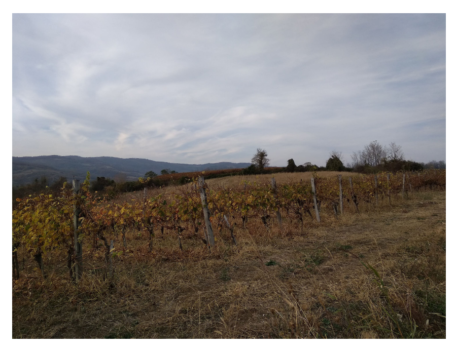
Figure 2 - The Vampirlija hill from the south